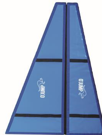
Ref. 910 (911+912)