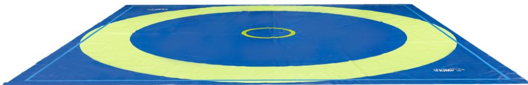
2- Competition marking