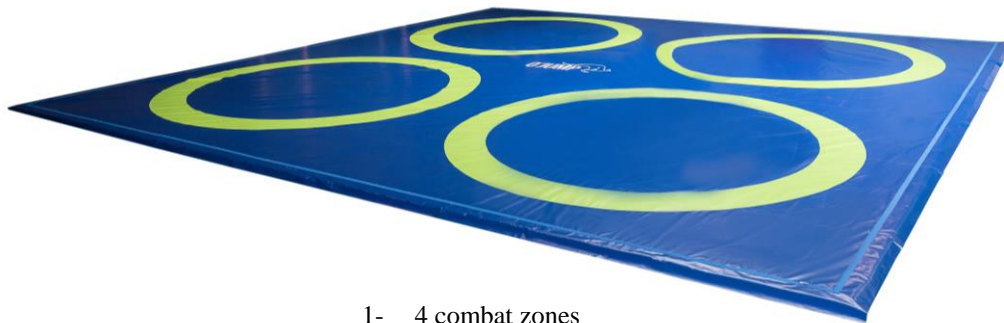
1- 4 combat zones